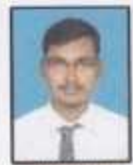
SUMANTA NATH CHHABI ELECTRICALS EE