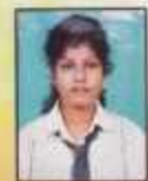
ARPIA CHANDRA MAHLE FILTERS CE