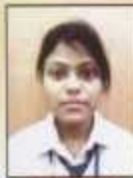
TITIR MANHA AMPLE ETCE