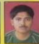
SAYAN BHANDI CYBER POWER, CREATIS ELECTPOWER ETC