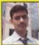
SUMALI ROY SREAPUR MUNDUTI ME