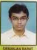
DEBBAJAN BARAT MAX BRIDGE CBT