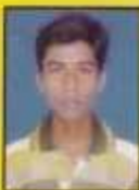
SNEHASISH BARKAR EBSLIME ETCE