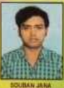
SOUBAN JANA L & P SCMAPPA ME